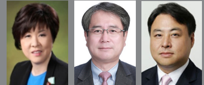
KWAK JIN-YOUNG Vice-Chairperson Anti-Corruption and Civil Rights Commission, Republic of Korea