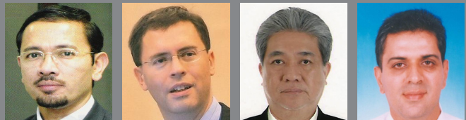
MUSTAFAR ALI Deputy Chief Commissioner (Prevention), Malaysian Anti-Corruption Commission (MACC)